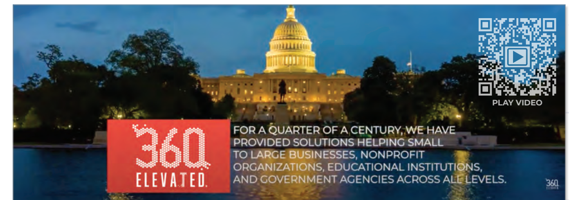
Government Video Thumbnail

Nearly Three Decades as a Full-Service Advertising, Marketing, Web, and Public Relations Firm